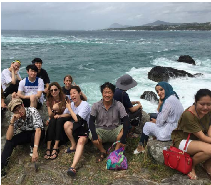
2019 International Peace Camp in Jeju participants visited the sea in Gangjeong and enjoyed the view on the ocean. This was the water group which spent time together, in or at the water. We also went to a bowling hall and had a great time together.

From Friday, August 9 to Wednesday, August 14 a peace camp was held in Gangjeong Village. 38 people came to this camp to learn more about the peacebuilding in Gangjeong but also to listen to the history of Jeju Island and its people. The Frontiers, Korean Peace Foundation, YMCA and MAP (Migration to Asia Peace) put a nice program together, in which the participants were able to learn more about peace, the history of Jeju and also other cultures. We had different kinds of activities over 6 days, including “human books”: some of the camp members shared their stories and experiences as refugees and answered questions. In the morning we had free discussion time about why we’re here and we also had lectures in which we learnt more about peace and nonviolent resistance. There was also time for exploring and enjoying the nature of Jeju. We spent time at the Gangjeong Stream to escape the hot weather, and also visiting the Bijarim Road Forest and Alddreu Airfield. After an amazing festival at the end the camp, we shared with each other our experiences, thoughts and what we had learned during this time.