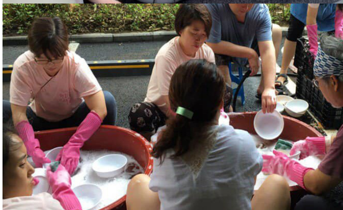
Food preparation team making rice and doing dishes