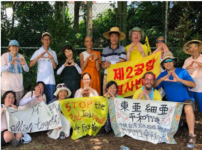
Visitors from Hawaii briefly joined the march and demonstrated the hand symbol presenting Mauna Kea