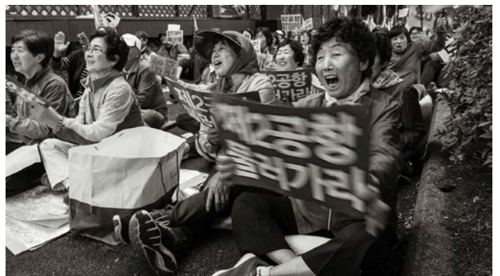
Residents in Seongsan actively join protests against the 2nd Jeju Airport (air force base).

On July 11th, MOLIT attempted to have an information session on the Environmental Impact Assessment but it faced people's protest, too. When there was a public hearing on it on Aug. 22nd, activists pointed out that they could independently find many caves and 69 soomgols (the passages through which rain enters to underground water in Jeju), whereas the EIA mentioned only 8 soomgols. It means the 2nd airport would cause serious flood damage and exhaustion of the underground water supply. It turned out that the government EIA is unreliable and merely a formality to justify the project.