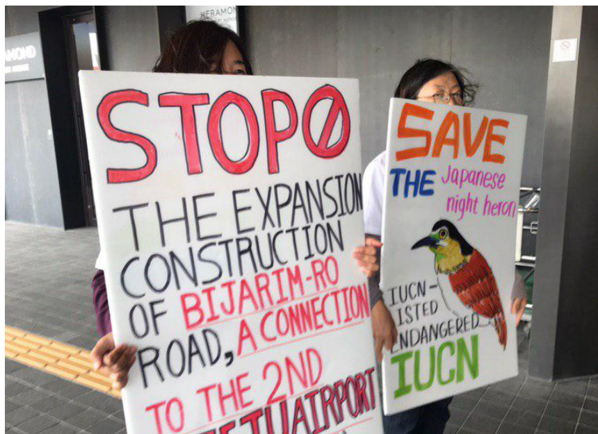
Pickets held by people at the venue of the 2019 Sustainable Development Jeju International Conference hosted by the Island for the first time in Jeju City on June 18, 2019.