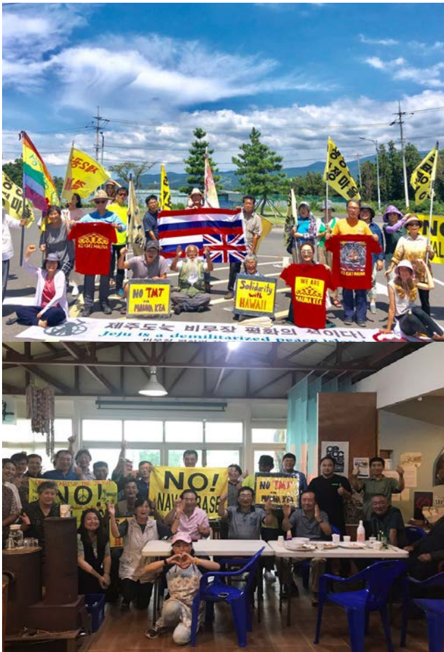
At the daily noontime human chain (on Aug. 31, above) and at gatherings such as the Association of Gangjeong Villagers Against the Jeju Navy Base (on July 21, below), Jeju people expressed their solidarity with the Mauna Kea protectors in Hawaii.

Groups of Sāmoans, Fijians, Tongans, Micronesians, Filipinos and Koreans have visited Pu'uhonua O Pu'uhuluhulu to pay their respects to the kūpuna and voice their support for the Mauna Kea Protectors. At the time of this writing, no construction has begun on Mauna Kea. Meanwhile, on August 23 the Hawaii Supreme Court ruled that the Hawaii Department of Land and Natural Resources failed to care for the land at Pōhakuloa Training Area (PTA), as required in its lease to the US Army. Located just beside Mauna Kea, PTA is used for live-fire training and large amounts of expended munitions including Unexploded Ordnance and Depleted Uranium are known to be present.