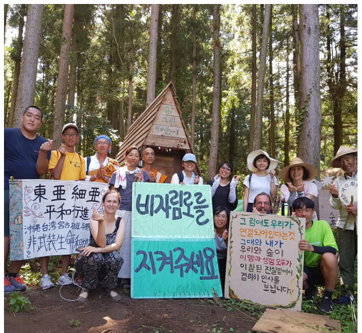
International participants visit Bijarimro

After the plans to construct a 562 ha air force base at Songaksan were cancelled in 1989, an agreement was made in 1992 for a civilian military joint use airport and the air force has ceaselessly pursued the project as a long-cherished desire. Thus, if the Seongsan 2nd Airport construction plan is carried out, Jeju will be degraded into a military base island, a tool of the US to restrain China, and it will be an eternal task for our descendants to get free from this predicament. I earnestly wish that more and more people who love Jeju and who love peace will join together to stop the unjust violence of the state and protect the nature of Jeju, a treasure island of all Koreans.