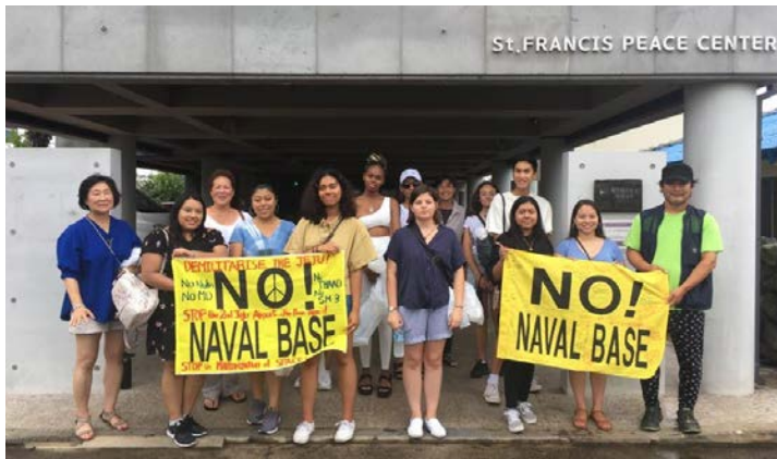
Women’s Rights and Peace of Bay Area, California, USA, visited Gangjeong on July 27th.

first public testimony in 1991, inspiring many women in the world with her courage.