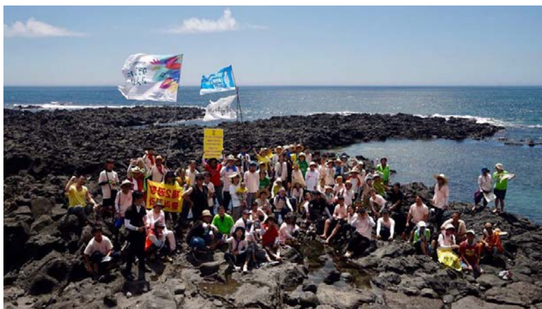
Resting by the ocean of Shinsan-ri, Seongsan