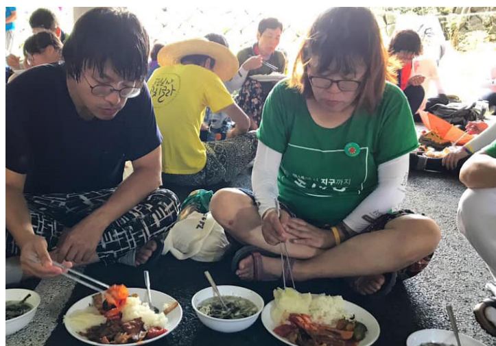
Participants during lunch / Photo by Oum Mun-hee