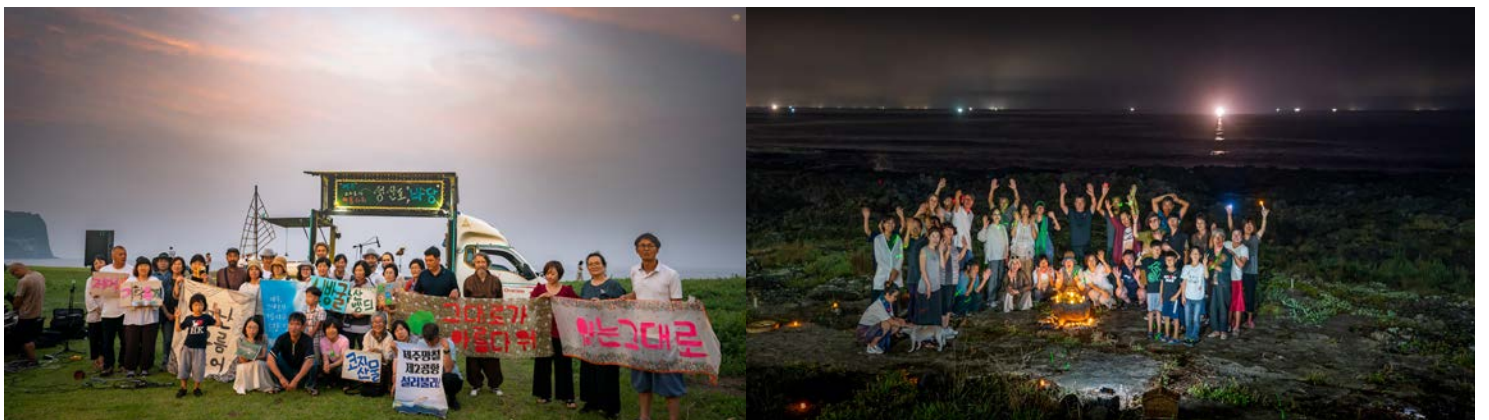
Open air concerts with the theme of "Jeju, Beautiful As It Is" were hosted at seaside cafes in Seongsan on July 14 and August 18 by the Seongnan Oreum Tour team (which guides visitors to the volcanic cones which are threatened by the second airport project) and the Tent Village people (who protest the second airport project outside the Jeju provincial government building). Attendees enjoyed the beautiful scenery, songs, poems, and shared picnic foods.