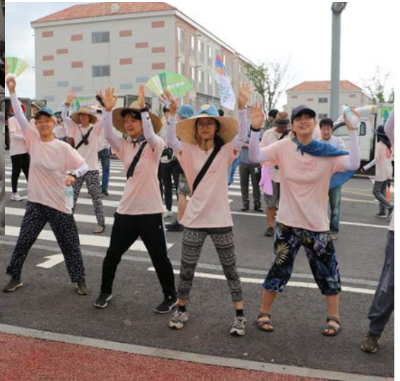
Students dancing in front of the Jeju Naval Base