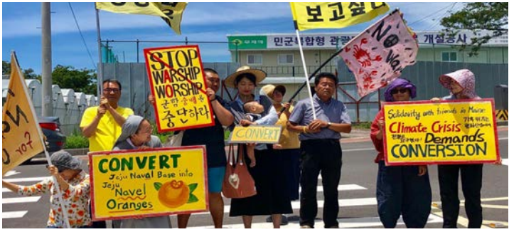
Solidarity from Gangjeong for friends in Maine, who inspired us to call for the conversion of the Jeju Navy Base. (Several tangerine orchards were destroyed to build the navy base, so how about converting the base to grow navel oranges?)