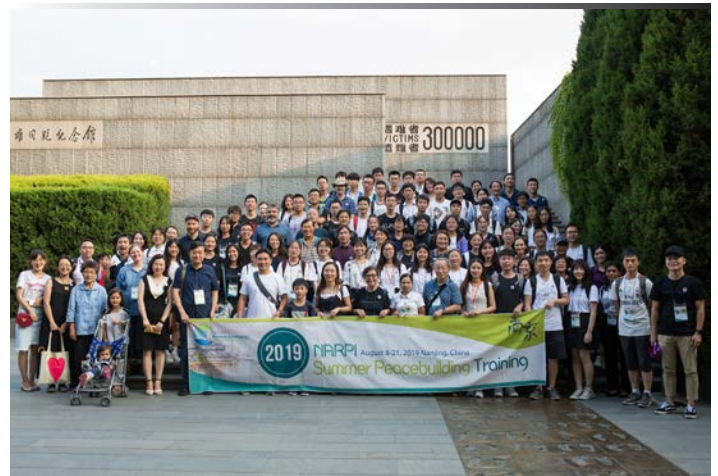
At the Nanjing Massacre Memorial Hall, NARPI participants listened to the testimonies of survivors and participated at a ceremony to remember the victims.

NARPI participants visited the Nanjing Massacre Memorial Museum, listened to the testimonies of survivors and participated at a ceremony to remember the victims. We also visited the new Comfort Women Museum which has a very complete, multilingual exhibition, and a new private Anti-War Museum. During one morning lecture, a professor shared that missile defense (MD) radar is seen as the main threat by the US to China. NARPI was a chance to not only feel the real tensions surrounding past and present conflicts, but also to build bridges for cooperation and understanding.