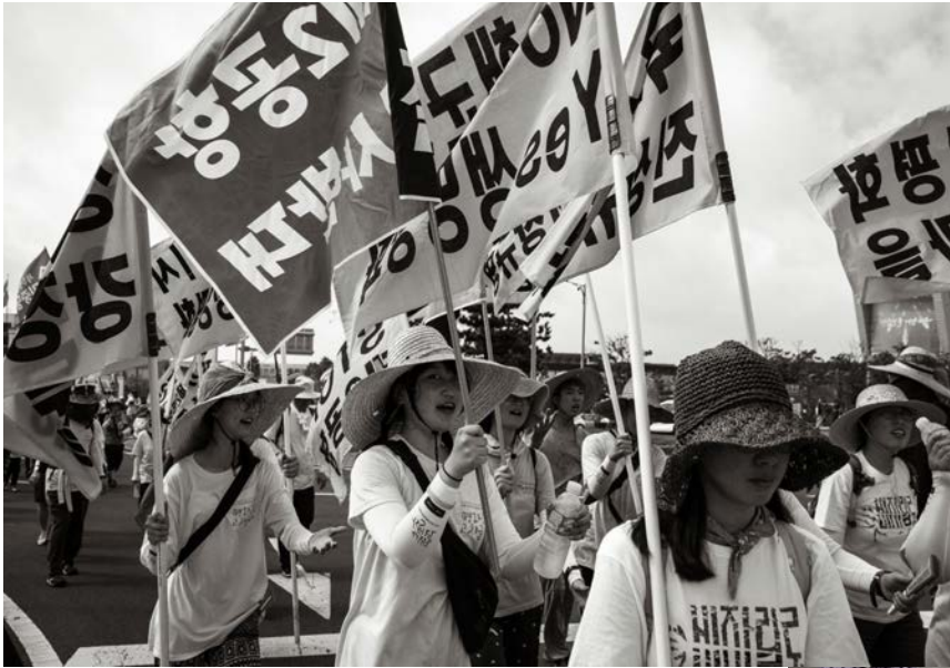
(Left) Departing from Gangjeong village