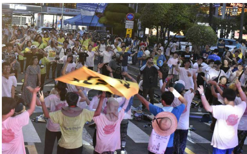
March finale festival at Jeju City Hall