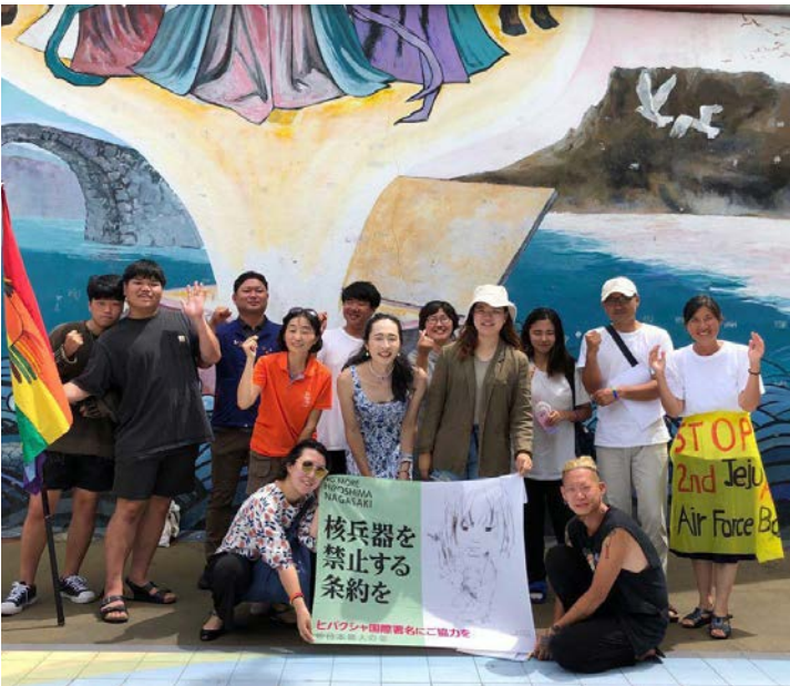
This green and white flag was given by a Japanese women's association; it reads 'No more Hiroshima, no more Nagasaki.' Photo at Jeju City Hall by a Jeju citizen.