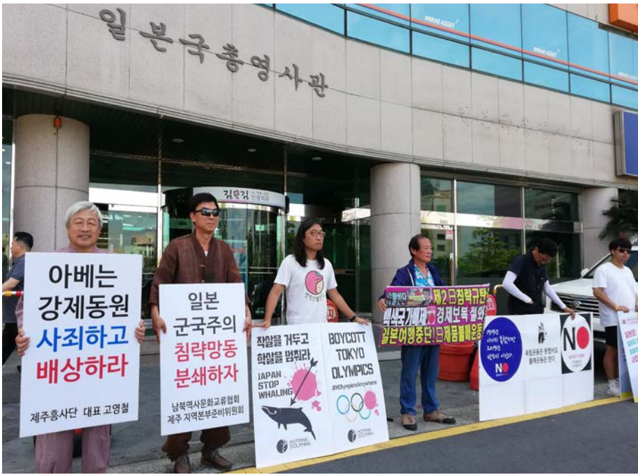
Hot Pink Dolphins staged protests in front of the Japanese consulate in Jeju to criticize whaling and the radioactive Tokyo Olympics.

Japan resumed commercial whaling on July 1 after a 31-year hiatus. So far Japanese whalers hunted 12 minke whales and 67 Bryde's whales. Their goal is to catch 227 whales until the end of this year. It is particularly problematic for the East Asian countries such as Korea, Taiwan, China and Russia because the targeted whale distribution expands throughout the region. The whales migrate from the East China Sea through Korean waters to the North Pacific. Japan says the fishermen only kill whales in their territorial waters and its exclusive economic zone but the international borders mean nothing to the whales that swim freely across the ocean. Annual whale meat consumption in Japan dramatically decreased from 232,000 tons in 1962 to 3,000 tons today, a 98% drop. Simply put, people in Japan don't consume whale meat anymore when there are abundant other foods to eat. Then, why does Japan stick to