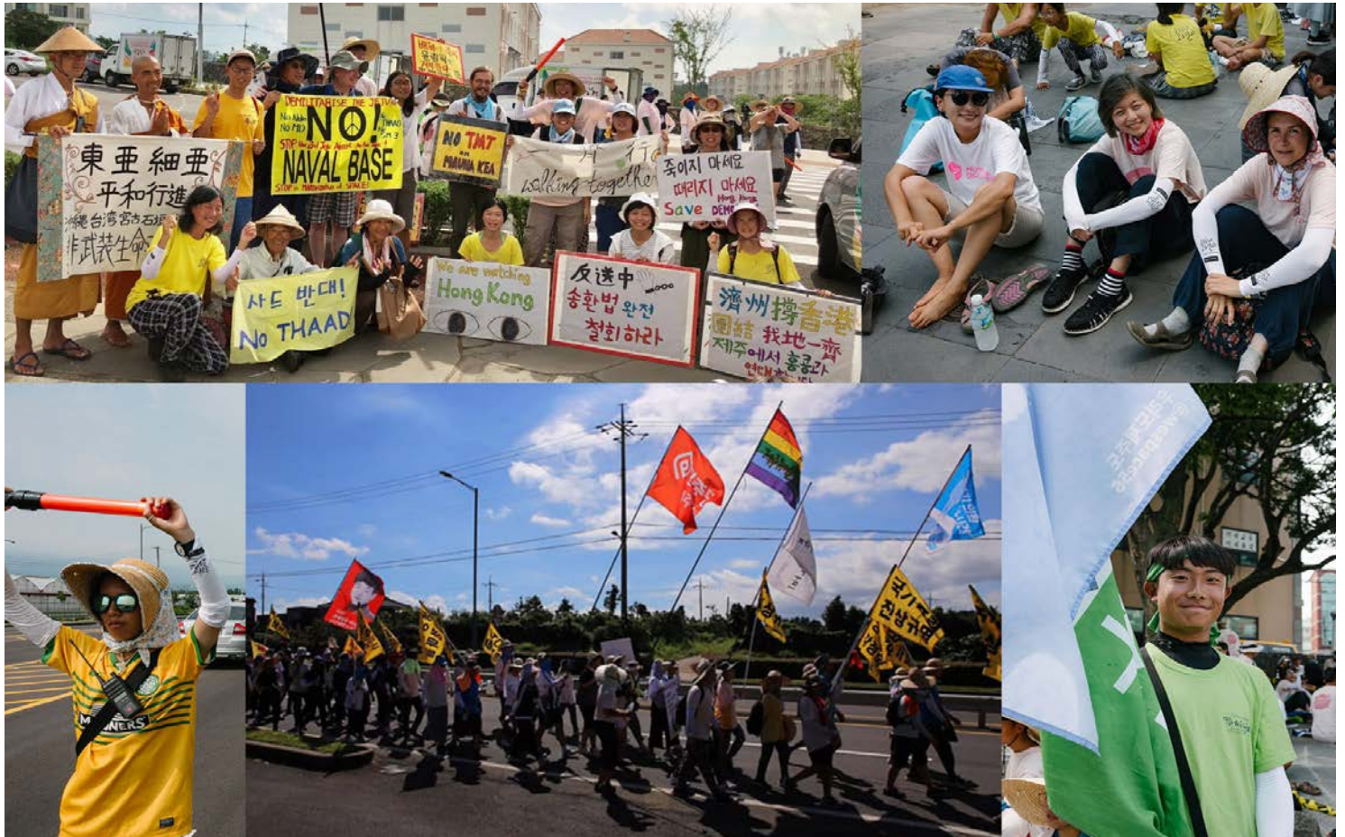
2019 Jeju Grand March for Life and Peace took place from July 29 to August 3