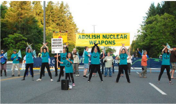
On August 5, a flash mob blocked the entrance to the nuclear submarine base in Bangor, Washington, USA, where 8 Trident SSBN submarines each carry the force of 1,300 Hiroshima bombs.