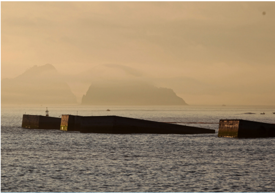
Image: Cho Sung-Bong The massive concrete caissons, which the navy plans to use to support a long future pier, were knocked off their foundations and partially sunk as a result of weak and short Typhoon Khanun.