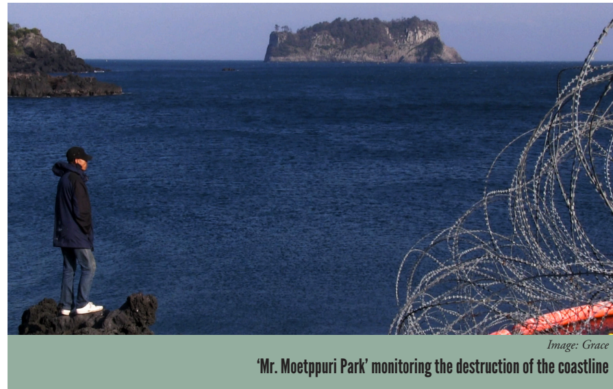
Image: Grace 'Mr. Moetppuri Park' monitoring the destruction of the coastline

Central to all of this is ending the Korean War, with the US signing a peace treaty with North Korea. But it will take more than signing a document to end over half a century of enmity and mistrust—it will take a new approach to achieving security. This is why it will take women's leadership, because women realize that genuine security means having health, education, and freedom to live without fear and want. From Ireland to Liberia, brave women have stood up to end violence and conflict. We can and must do the same for Korea.