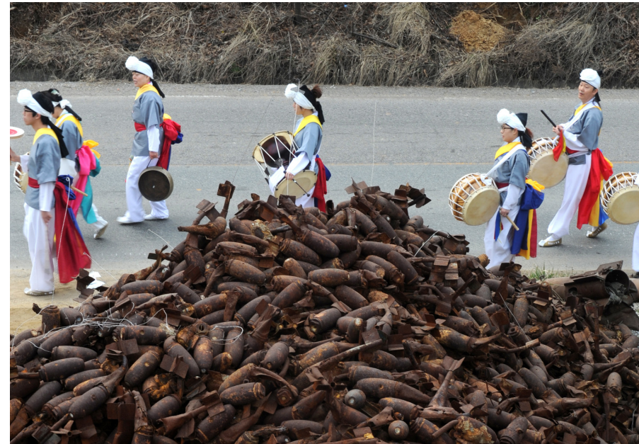
Image: "This Moment" from special edition of the Hangyoreh newspaper on April 1 by senior staff reporter Kang Jae-hoon Dreaming of a Peace Ecological Park, plum tree planting ceremony was held on March 30 at Maehyang-Ri, formal US Air force bombing range. Residents have stacked the shells of the bombs in front of the residents' committee office that were collected from the sea and residential area. Residents suffered extreme hardships for 54 years until it was finally closed in 2005, thanks to the people's persistent and dedicated struggle.

MAYOR: Yes, young people here move to the cities. We need people to continue farming to keep our values intact. An old Korean saying, "Farmers are the best under the sky." Everyone eats when farmers grow food. Young people have lost these values, they think it's enough to have nice clothes, but the most essential is food.