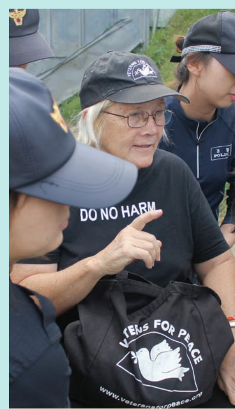
After a visit in 2011. Retired U.S. Colonel and current peace activist Ann Wright, returned to Gangjeong village to show support.