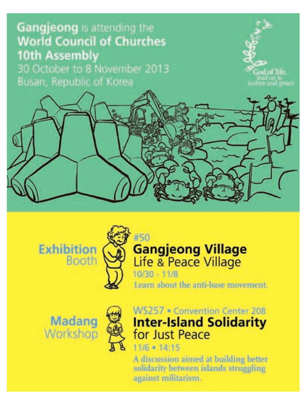
Gangjeong will join the World Council of Churches (WCC) 10th Asssembly in Busan, Korea at the end of October. They will host a workshop and also have an information and history exhibition booth.

If the Gangjeong Book Village were just one book, then how many pages would it have? Artists have made street bookshelves; this cooperation is perhaps only the second page. We have so far to go. Maybe the book called Gangjeong Book Village will take 30 years to be read. Or perhaps it's an endless story as long as books exist on this earth. In other words, we will read Gangjeong long into the future because we cannot take our eyes off the story of this village.