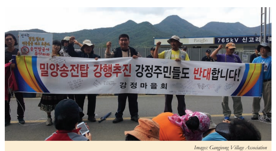
Gangjeong villagers and activists in Miryang, holding a bnner in support and solidarity.