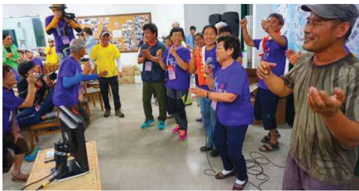
Gangjeong, Ssang-Yong, Milyang, Chungdo, Sewol, and Yongsan all meet together at Gangjeong Village for a wild night of foods, drinks, and singing merriment.