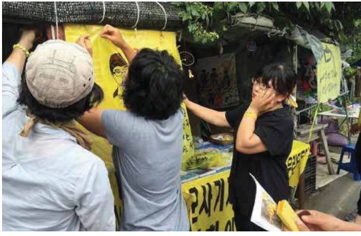
The mother who lost her son from Sewol Ferry Tragedy visited Gangjeong Village during the Grand March for Life&Peace. At the tent of mass, every night some activists light the paper lantern that is drawn with a different story of student victims. On the day the mother was there, coincidentally her son's story was hung and she happened to see it and couldn't help crying at the moment.