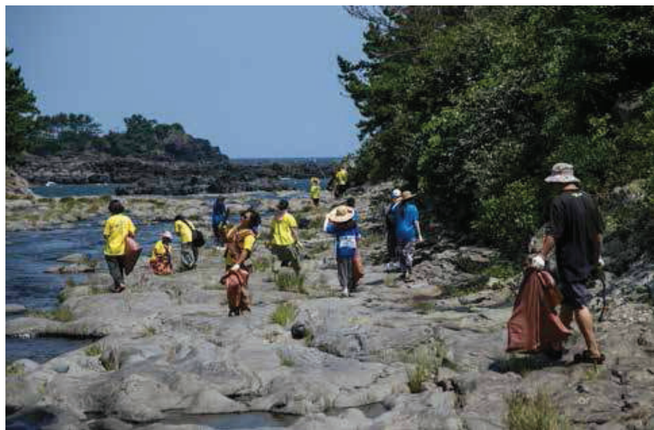
Image by Wooki. Both in July and August, there have been a cleaning day organized by the committee of Gangjeong Village Anti base movement for Gangjeong River flowing just next to the naval base construction site. As the summer vacation season continues, more travelers and visitors enjoy the river. Some people carelessly litter.

There will be a peace conference in the Center for three days from Sept. 7 to 9. The conference will feature presentations, discussions, and meetings relating to the theme, "Reviewing, Reflecting On, and Planning for the Demilitarization of Jeju, the Peace Island." Specifically, the challenges of transforming the 1930s-era Japanese Alldreu airfield into a Peace Park, building solidarity for demilitarization and peace in Northeast Asia, and establishing strong Peace Education programs will be addressed during the conference.