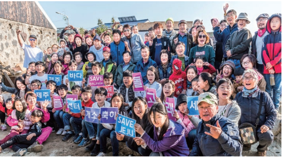
The opening ceremony of Jeju Dolphin Center, headquarters of Hot Pink Dolphins' marine environmental movement, was held on Oct. 28 with a hundred participants.