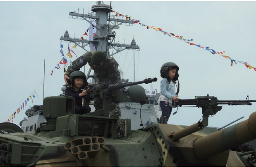
During the Fleet Review, the Jeju naval base was open to the public, only to be criticized for its insensitive encouragement of children to bear arms with the soldiers. It is a violation of the UN Convention on the Rights of the Child.

it's the normal citizen's job to say no to the desire for military expansionism and to limit the ROK navy's role to defend its coastal waters. We have to make South Korea give up the plan and eventually scrap the unnecessary Jeju naval base.