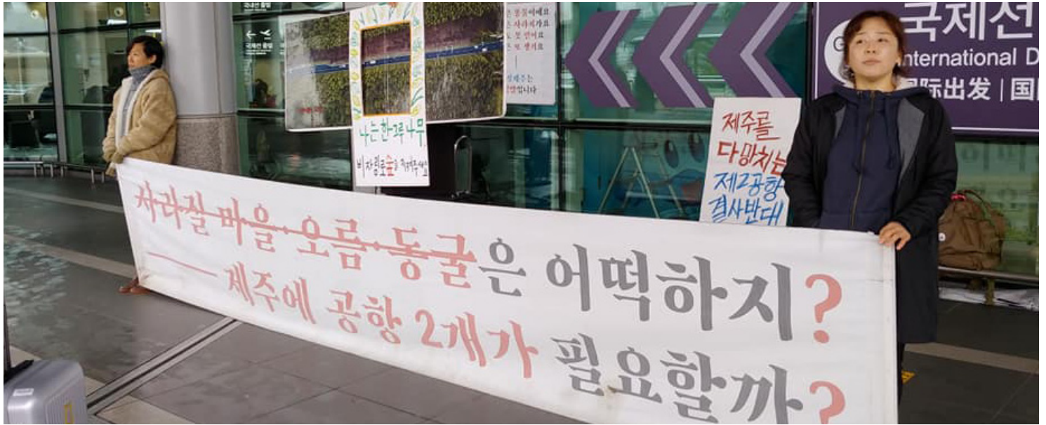
From Jan. 24, during the lunar new year holiday season a 'No Second Airport in Jeju' campaign was held at Jeju international airport. The banner reads, "What about the villages, volcanic cones, and caves that will disappear? Does Jeju need 2 airports?"

An international petition in English language demanding that Korean government officials call off the Jeju 2nd airport (air force base) began on Dec. 9, 2019. It was followed by Chinese and Japanese language versions on Dec. 15. In its press release on Dec. 18, the Jeju People's Assembly Against the 2nd Airport (also called Jeju Islanders' Emergency Committee to Stop the Jeju 2nd Airport) stated that a total of 507 internationals including Prof. Noam Chomsky and feminist Gloria Steinem, as well as other renowned scholars and activists signed on the petition. Many media in South Korea covered the news of the international petition, enough to draw attention from one of the main South Korean web search portal sites. The last part of the international petition reads, "We must seriously consider and stop reckless development and militarization, the main culprits of the climate crisis. Jeju is not only for islanders. The concerns of Jeju, one part of our Earth, concern all of us, citizens of the Earth, as well." The petition is ongoing. You may join the petition- see savejejunow.org .