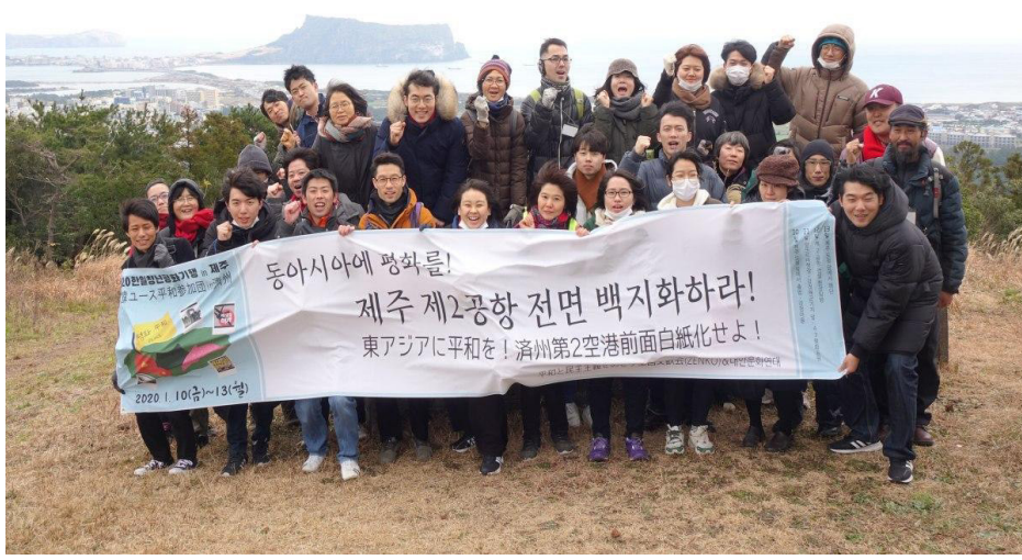
Participants of the 2020 Korea-Japan Youth Peace Trip hold together the banner which reads, "Peace in East Asia! Totally cancel the Jeju 2nd airport project!" in Seongsan, Jeju, where the government plans to build the Jeju 2nd airport.

From Nov. 30 to Dec. 8, I joined the ZENKO's '2019 Peace Speaking Tour' in seven regions of Japan: Sapporo, Tokyo, Okinawa, Hiroshima, Kyoto, Hyogo, and Osaka. I shared the situation of the Jeju navy base and the planned Jeju 2nd airport. And '2020 Korea-Japan Youth Peace Trip' was held in Jeju for four days from Jan. 10 to 13, 2020. The event gave 40 Japanese and South Korean young adults a chance learn the history of Jeju and to visit the sites of struggle against Jeju navy base and the Jeju 2nd airport, as well as Aldreu airfield.