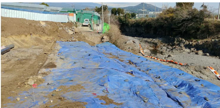
Upstream of the habitat of mandarin ducks [a National Natural Monument], the new access road to the navy base is polluting the Gangjeong River.