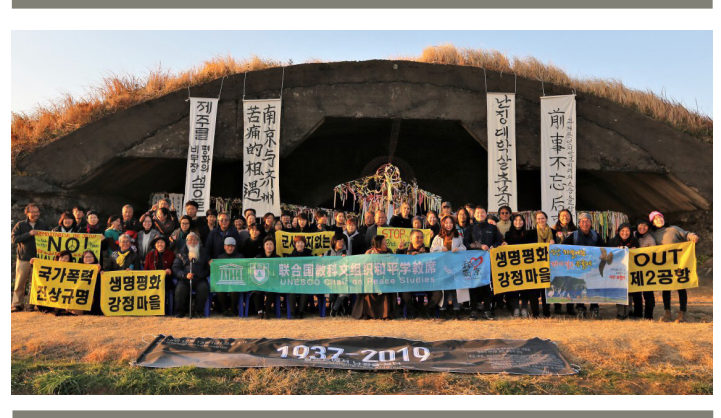
"1937-2019: Seeing Nanjing from Alddreu" brought together many people working for peace around Jeju and Northeast Asia. Three students brought a banner from the UNESCO Chair on Peace Studies at Nanjing University.