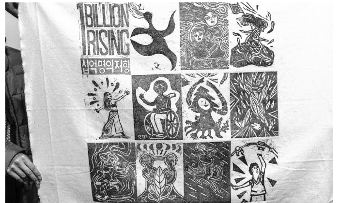
A woodcut printing workshop was held at the Peace Center on Feb. 23. Eastasia Ecotopia is collecting woodcuts from 100 people to make a banner for international women's day and for solidarity with the One Billion Rising movement.

Created and designed by the Gangjeong International Team, special thanks to Everyday Practice. Published by the Association of Gangjeong Villagers Against the Jeju Navy Base, 596 leodo-ro, Gangjeong-dong, the Life and Peace village, Seogwipo-si, Jeju, the Peace Island, Korea 63563 Email: gjengnews@gmail.com Special thanks to Gangjeong Friends for financial support.