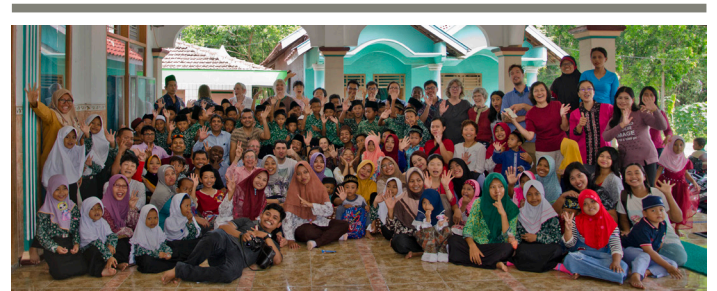
Photo Caption: On Jan. 15 Creating Cultures of Peace participants visited the village of Tondomulyo, where local culture has transformed through building diverse relationships. The village suffers from severe flooding due to deforestation for palm oil production, and some participants from Tondomulyo practiced speaking out about environmental damage during the workshop.

deeper level. We could sense how the activities flowed together to build up a culture of peace and could learn about diverse ways that they are being applied around the world.