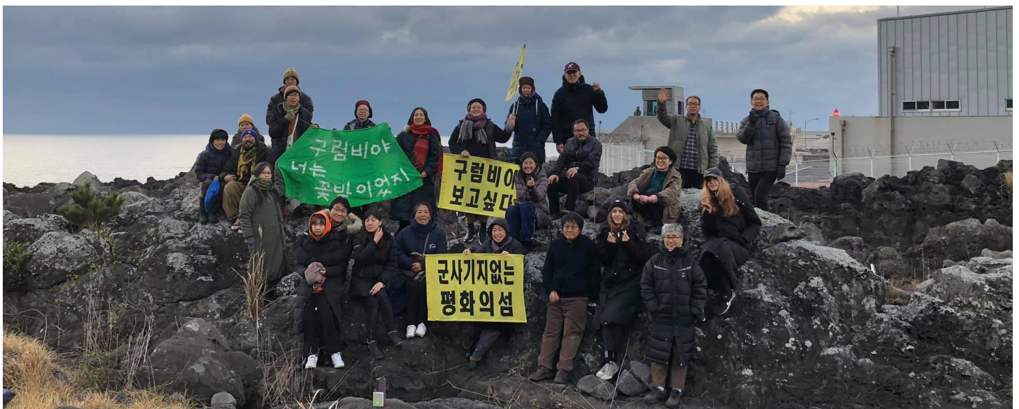
The New Year of Gangjeong started again with the life and peace 100 bows at the Metburi coast, east of the village on Jan. 1st. We thank everyone who supports our struggle. No Jeju Navy Base!

The new coronavirus (COVID-19) has not only caused tragic physical suffering and death, but the fear of the virus has contributed to further injustices and divisions between people wherever it goes. As of Feb. 24, there are only two confirmed cases in Jeju; both people caught the virus during recent travel in Daegu. One of these was a soldier stationed at the navy squadron at Jeju Airport. Gangjeong Village was notified after the fact that the other airport squadron soldiers who were exposed to the virus were quarantined in the single-occupancy residence at the Jeju navy base. Clear information regarding the details of their quarantine conditions and the risks posed to the community have been hard to obtain, accentuating the lie that the navy base exists in 'co-prosperity' with civilians. In order to prevent spread of the virus, special events (including the Mar. 7 Gureombi rock memorial) and daily activities (100 bows, the street mass, and the human chain) in Gangjeong have been temporarily cancelled for the end of February and early March.