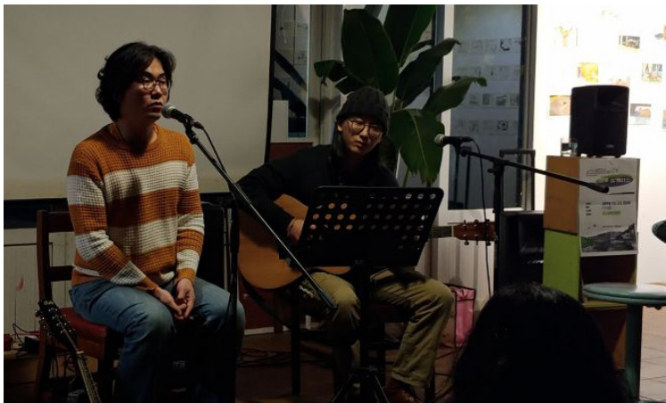
In summer 2019 'Act with Media' visited Jeju to conduct media activism workshops and to create music and film about the struggles in Jeju. On Dec. 22, the musicians that participated in the event returned to Gangjeong for a concert of their new album "Island's Song," made of the songs they composed during their last trip to Jeju.