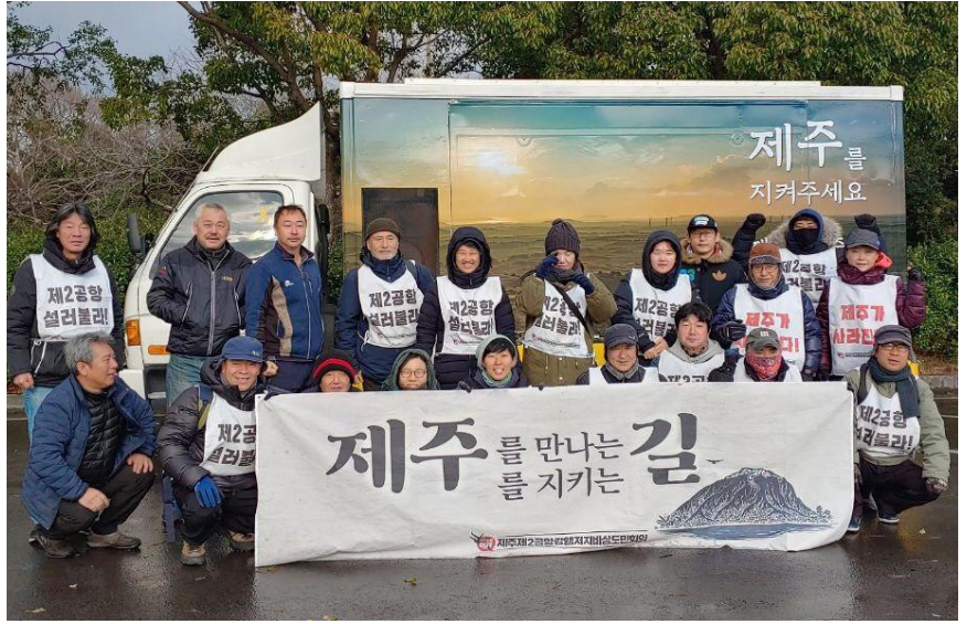
The Assembly people dropped by Gangjeong in their pilgrimage and were joined and greeted by Gangjeong people who expressed solidarity against the Jeju 2nd airport (air force base). Photo by Song Jiyoung on Feb. 18th.

On Dec. 19th, last year, the Ministry of Environment (MOE) demanded a 2nd supplement on the poorly supplemented draft of the Strategic Environmental Assessment (SEA) submitted by the Ministry of Land, Infrastructure, and Transportation (MOLIT). The MOE demanded MOLIT to make additional research on the actual conditions of winter and spring migratory birds and the possibility of bird strikes. Therefore, the MOLIT plan to make public notice on the Basic Plan of the Jeju 2nd airport was delayed to at least after May. Otherwise, Jeju Island Council formed a special committee to settle the conflict on the 2nd Jeju airport and commissioned the Korean Association for Conflict Studies (KACS) work on the study of conflict analysis and settlement measures. It will be likely that the Island Council will proceed collecting Islanders' opinions after the general election this April.