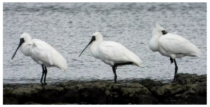
Black-faced Spoonbills (IUCN EN, National Treasure of Korea 205-1) near the proposed site of the Jeju 2nd Airport. On Jan. 18-20, a bird survey team visited important bird habitats which have been ignored by the Korean government. Surveys of birds, plants and insects are also ongoing at the Bijarim-ro forest.

Finally, I shared heirloom seeds from the Jeju branch of the KWPA and shared about the importance of heirloom seeds, biodiversity, and women farmers. During site visits, I shared about the environmental problems which Jeju is facing.